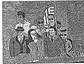
Part of the mural which was displayed in dietary.