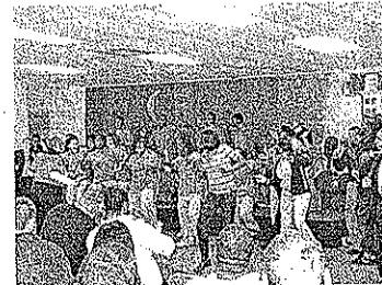
Guests joined in with the celebration of "It's a New Day."